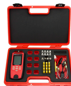
T130K4 Network & Coax Field Kit