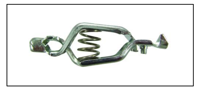
See page 20 for clip & insulator combinations.