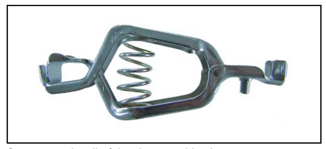
See page 21 for clip & insulator combinations.