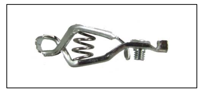
See page 16 for clip & insulator combinations.