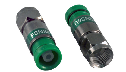
FSNS6U ProSNS™ Universal F Connector

Installations in Commercial and Residential Audio/Video, Security, and Broadband markets will be a "snap", thanks to the low compression force associated with traditional Snap-N-Seal® connectors along with the patented non-blind entry with a floating pin design from F-Conn®.