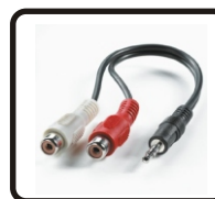
3.5mm male to female Stereo RCA adapter cable Included