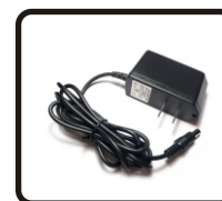
40-1080RPS Receiver external power supply (Optional)