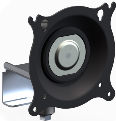
LAN STATION LCD MONITOR MOUNT

Kendall Howard LAN Station Monitor Mounts now sold individually or in pairs