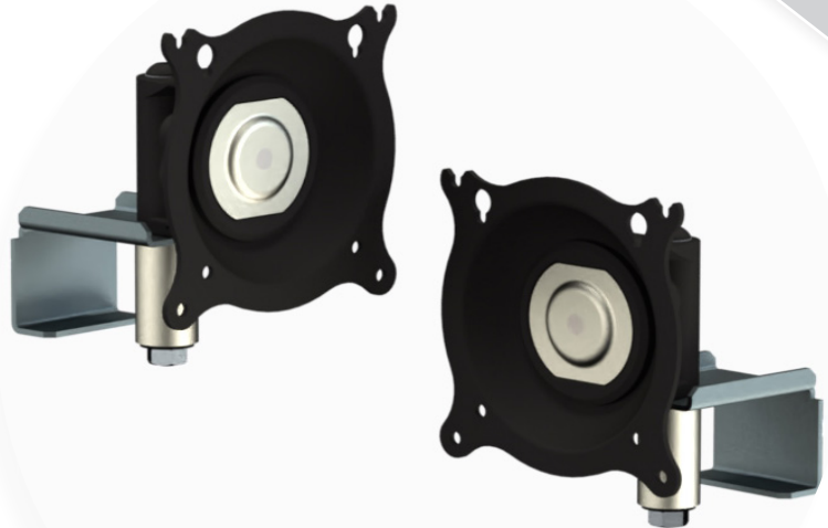
LAN STATION LCD MONITOR MOUNTS 2 PACK