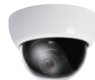
Shown with included paintable, snap-on Chameleon Cover™