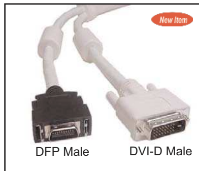
DFP Male DVI-D Male

Please note pin count for proper unit application and configuration