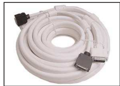
DVI Output DFP Output