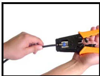
Step 3. Crimp connector