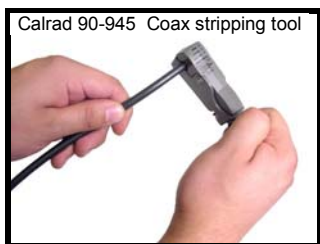
Step 1. Prepare cable