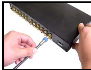
Step 4. Finished end

4 easy steps in less than 1 minute from start to finish providing a weatherproof seal with a compression fitting that helps prevent signal loss, all without the need for soldering. Terminate RG6 and RG59 cables. Use Calrad 30-289 series colored rubber boots to identify cables and connector ends.