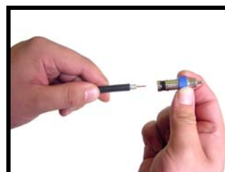
Step 2. Attach connector